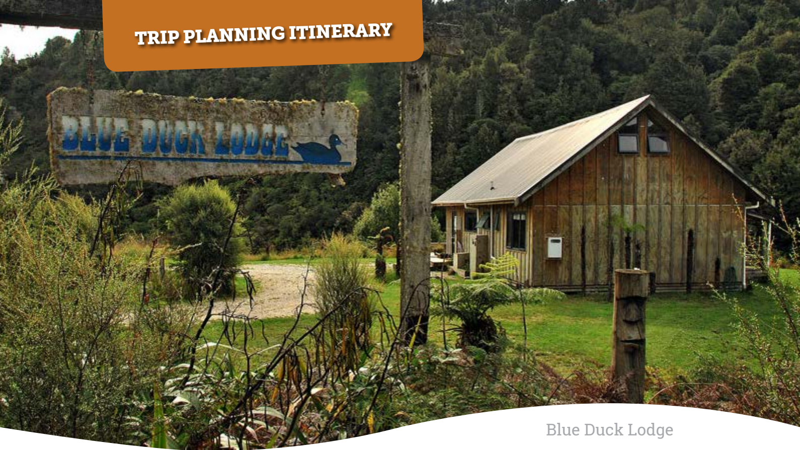
Blue Duck Lodge