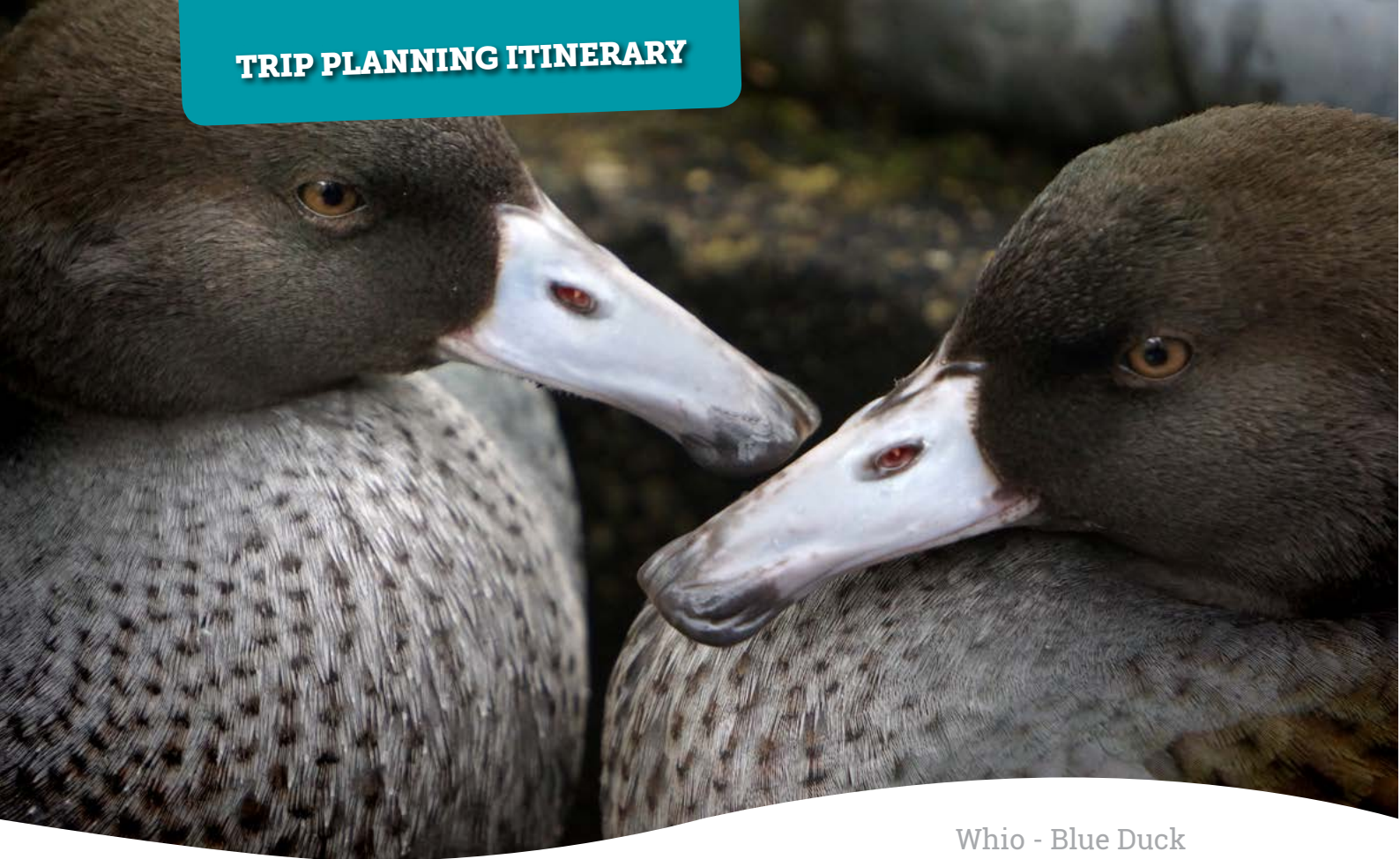
Whio - Blue Duck